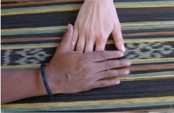
Above: Signature photo for our collaborative textiles range to be released in late 2013

researchers have gained unique learning experiences. These skills exchanges have built their professional and personal confidence. As these volunteers were immersed in the different cultural landscape of rural Timor-Leste, their experiences and understanding enrich the landscape of multicultural Australia. The next phase of our collaborative work will commence in April 2013.