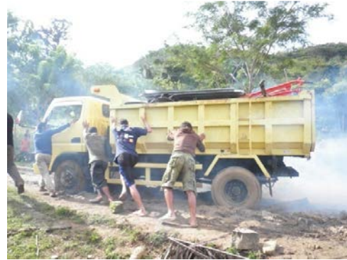
Above: One hour was needed to push this truck out of a serious bog.

The months between August and November – known as the “hungry months” due to food shortages – are hot and dry. Eight in ten families are engaged in subsistence farming activities and only 39% are engaged in economic activity, compared to the national average of 46.4%. Even this economic activity is not the same as paid employment, however.