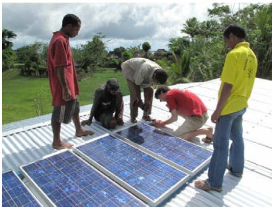
Above: Australian and Timorese volunteers installing the solar panel

The women's centre was completed in 2010 and is the first of its kind in rural Timor-Leste. With high powered solar panel, directional LED lighting and 500lt water tank, the building was completed by five self-funded Australian volunteers and a team of 18 local and international volunteers.