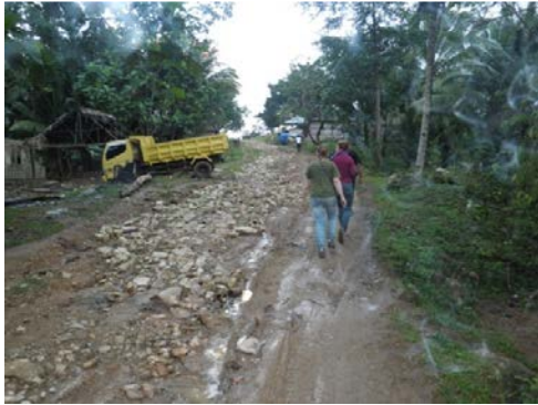
Above: the state of the roads in Iliomar.