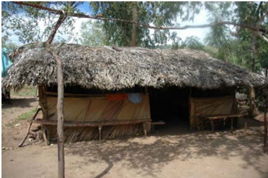
Above: typical housing for the poorest community members

Importantly, official statistics demonstrate the burden that poverty places on women and girls in the area. Only 19% of women are engaged in economic activity (compared to the national average of 31.3%). The difficulty of accessing the closest hospital seriously inhibits good health; for example, only 43 of 1,565 births (3%) occurred in a hospital in 2010. One in four women are illiterate, less than 3% of girls are enrolled in secondary school (compared to the national average of 17.9%), and half the female population has never attended school at any level. Of the 1,420 houses in Iliomar, 83% do not provide sufficient protection against the elements. 96% of families still cook with wood. Only 23% have sanitation and only 17% have electricity.