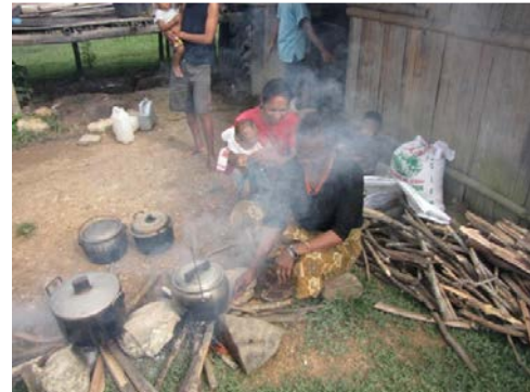
Above: typical cooking and kitchen facilities

In summary, the last decade of economic growth and Dili-centric development has not improved the quality of life for women and girls in Iliomar. They lack basic infrastructure and services, and access to development opportunities is prohibited by their isolation, illiteracy and formal education. Malnutrition, mortality and the burden of disease are also high in comparison with the national average.