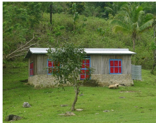
Above: The completed Women's Centre, Fuat Village, Iliomar